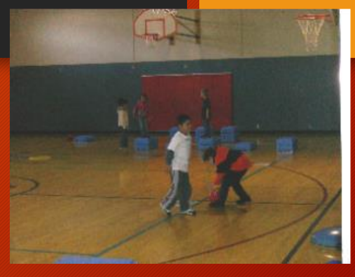
Physical Education (PE)